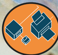
TIME & ATTENDANCE SOLUTIONS

Our comprehensive tax services are worry-free. We will impound your tax liabilities and make the payments to the correct agencies on time. Tax services include EFTPS mandated tax payments to Federal and State agencies, New Hire Reporting to all 50 states, electronic wage reporting, complete quarterly and annual tax form filing, and much more.