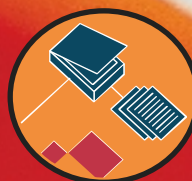
HR INFORMATION SYSTEMS

P.O. Box 361225 Birmingham, AL 35236 205.978.7198 1.866.947.2727 www.HRMasap.com